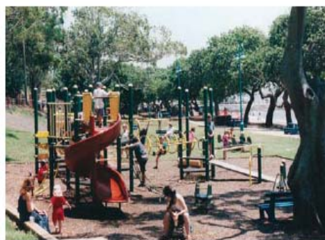
The community using and caring about its shared places

There are three main concepts behind the theory of CPTED.